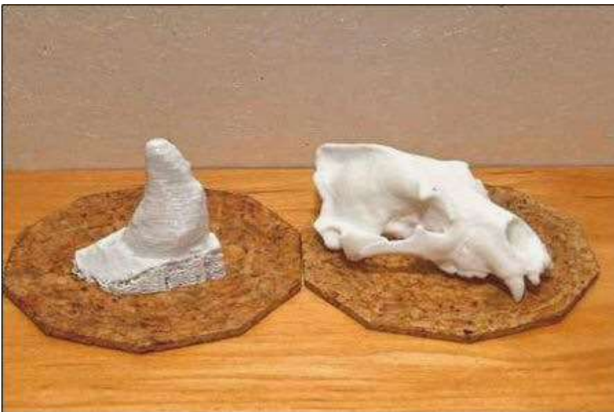
3D printed tooth and Bear skull