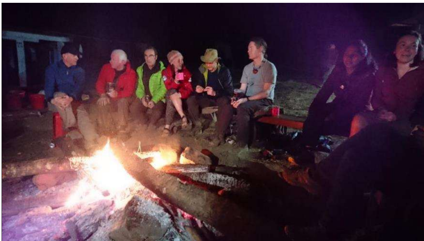
Meghalaya expedition members