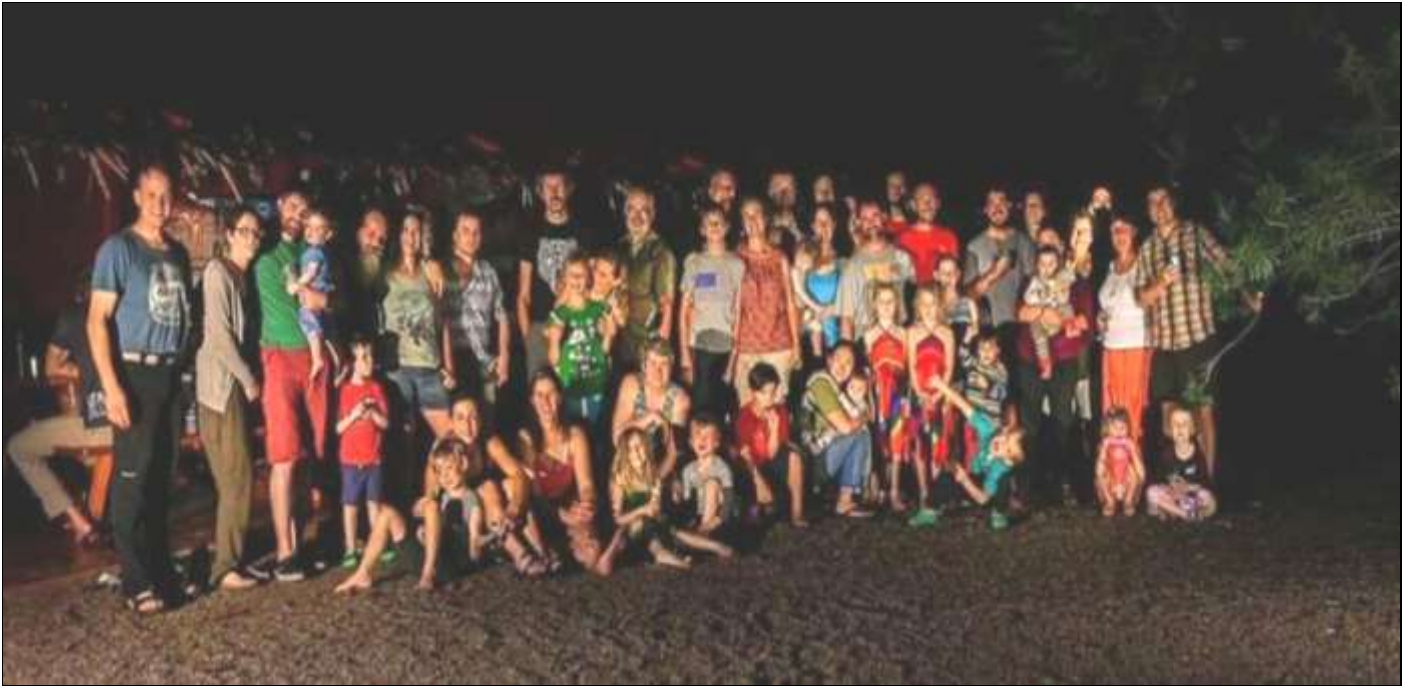
Family trip to Thailand [IF]

Good fun and caving was had by all. A full report to follow in the Bulletin